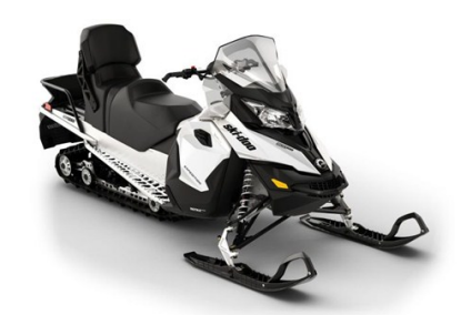
Bombardier 900cc Ace 4 stroke Scandic / LE Ride amongst the Giants - Ride in Luxury Back county -

Bombardier 600 cc Ace 4 stroke GT Saguenay multi-activity